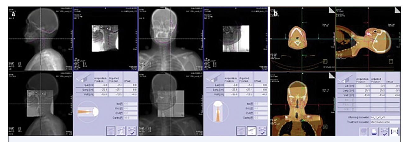
Fig. 1. (a) EPID images of a H&N patient for Left-Right and AP-PA. (b) Automaticly registered CBCT images.

MV-CBCT images were obtained by using the X-ray beam with 4 MV energy produced for only imag-